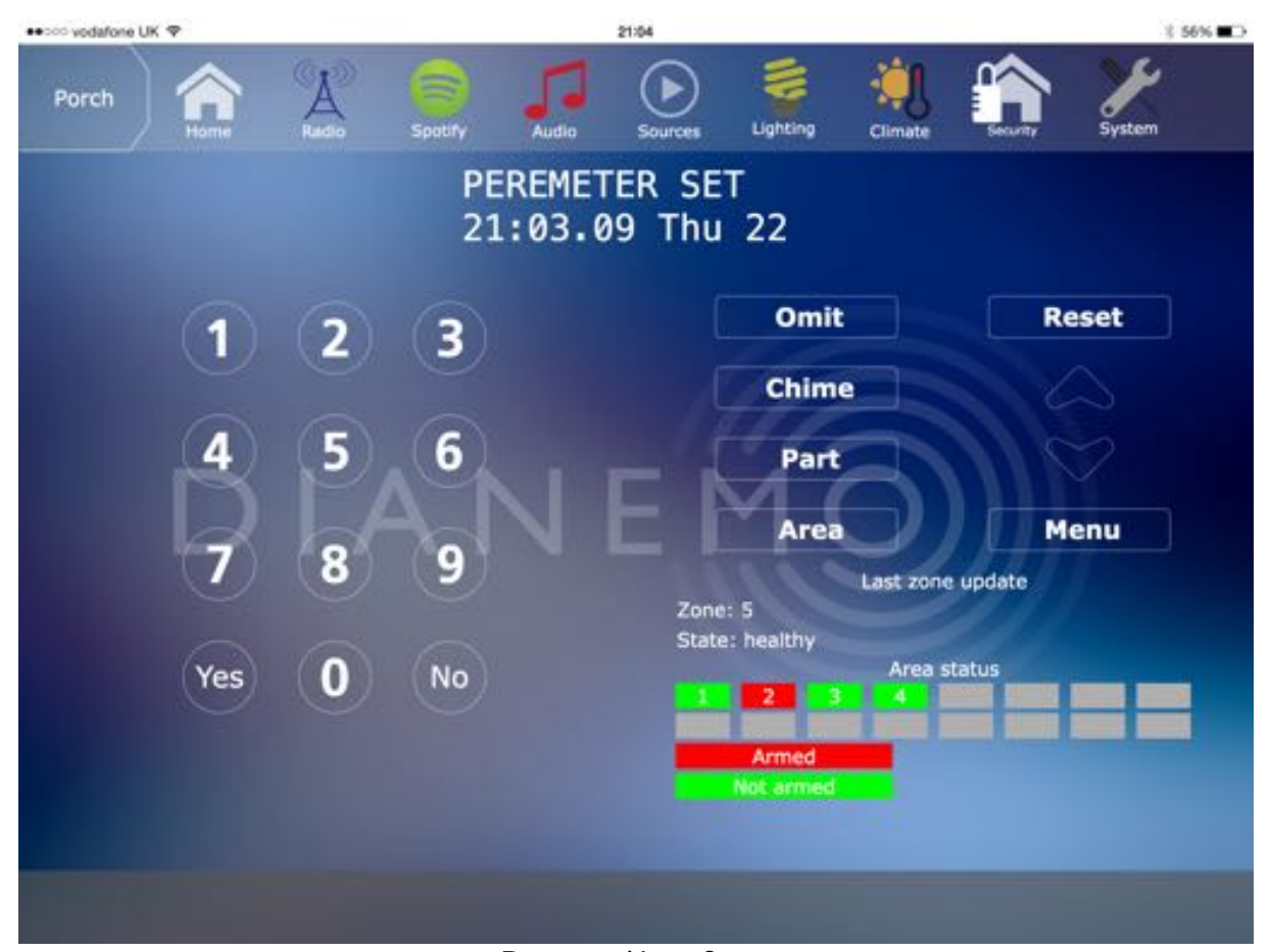
Dianemo Alarm Screen

Dianemo can provide an interface to alarm systems from Texecon. The Securty Alarm interface allows homeowners easy access to the features of their alarm panel via the Dianemo system which makes them easily accessible from the Dianemo UI.