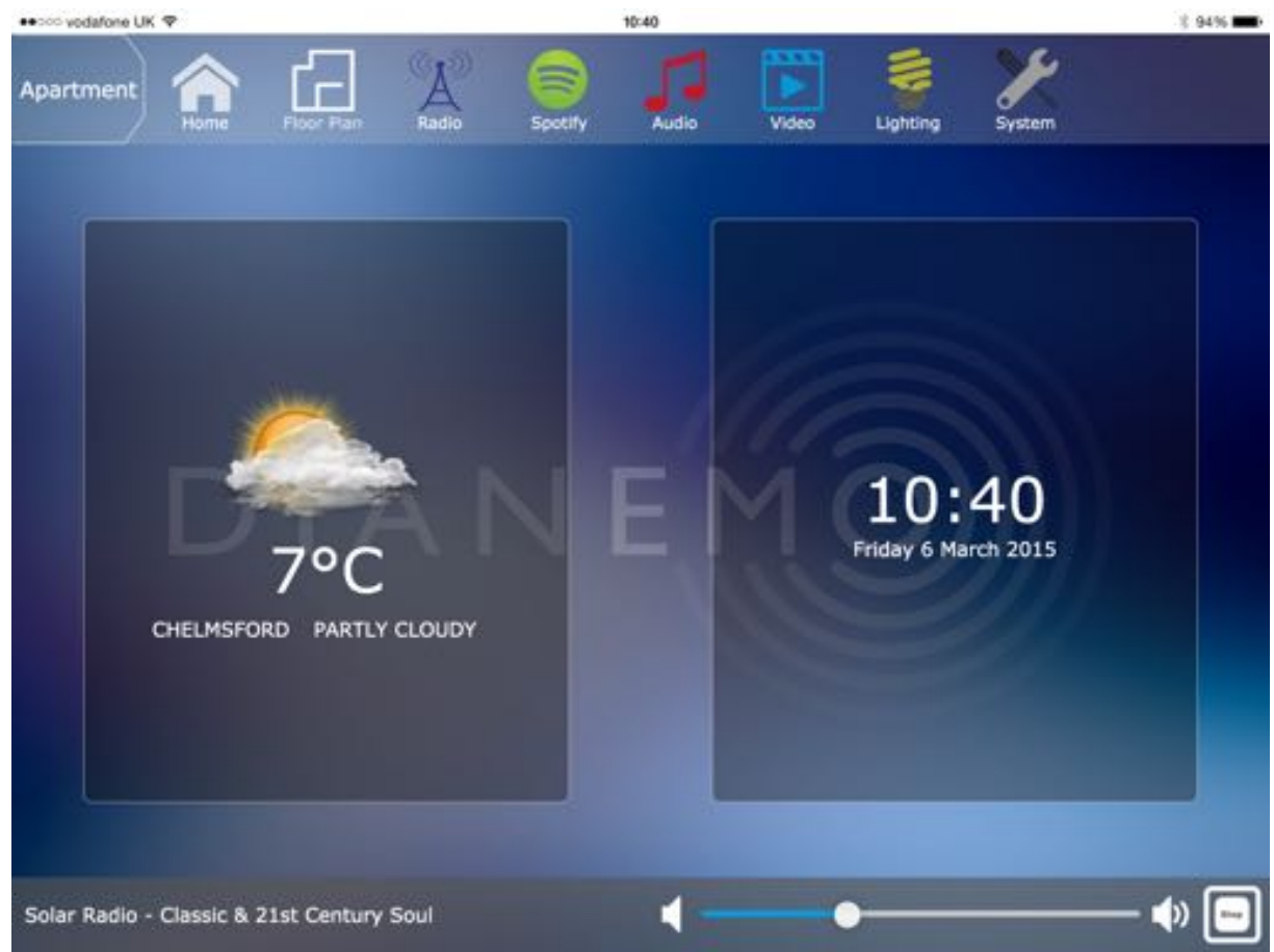
The Dianemo User Interface

Control of the system can be achieved in a number of ways from the same user interface (UI) and we currently support the iPod Touch, iPhone, iPad, iPad Mini and Android devices using our Free Apps. It is also possible to access the UI via a web browser on any PC, Apple computer or of course a traditional in wall touch panel. Secure remote access to the system is also available from anywhere there is an Internet connection.