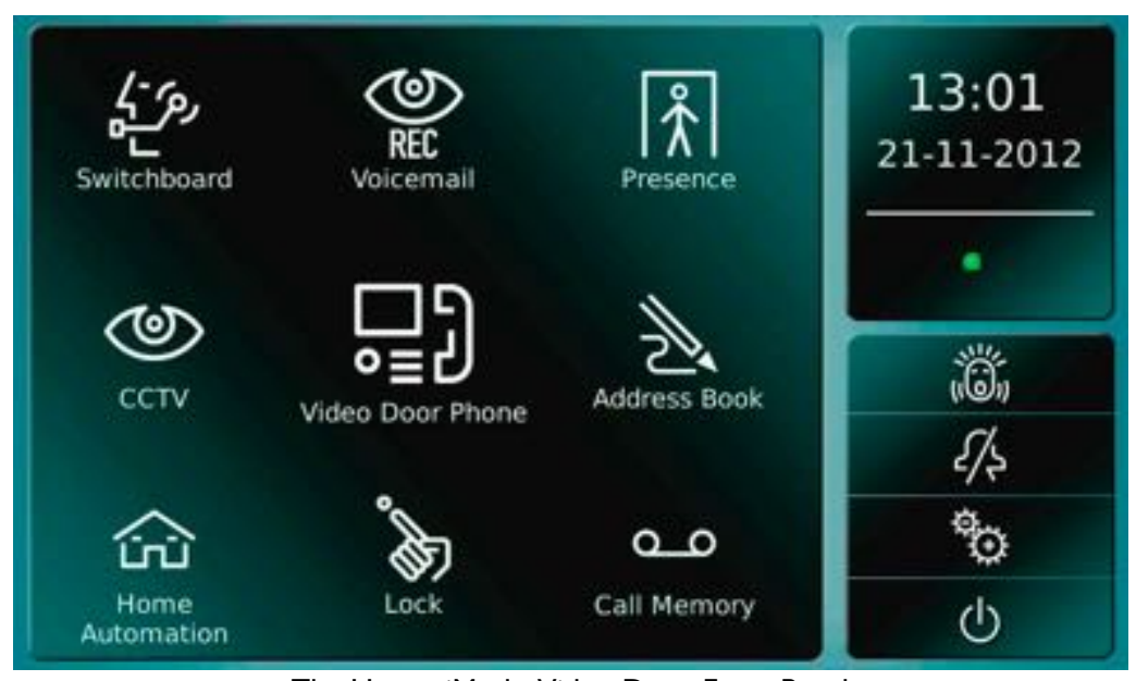
The Urmet iModo Video Door Entry Panel

All Dianemo Nerve Centres have an integrated Asterisk Voice over IP (VoIP) PBX. This allows full integration of SIP telephone trunks and internal IP telephone extensions. Using this facility Dianemo, can provide the interface to stand alone video door and gate entry systems or be integrated with building wide video entry systems like the iModo from Urmet.